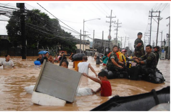
Image Right: Flooding in the Philippines, 2007 Image Left: "Humanitarian Implications of Climate Change: Mapping Emerging Trends and Risk Hotspots"

Flooding – an overflow of a large amount of water beyond its normal confines – can take many forms.